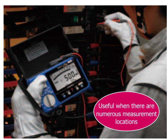
*In some cases, the capacitance component may prevent a judgment from being made until charging completes.

Since the IR4056-20 and IR4057-20 generate judgments as soon as the test lead makes contact, it is possible to make a rapid series of measurements in the manner of a continuity check.