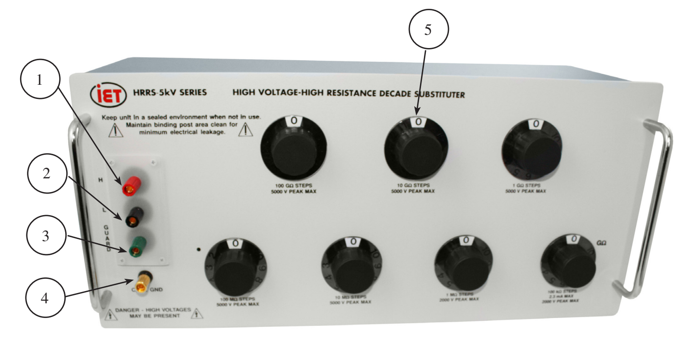
Figure 4-2: Replaceable Parts